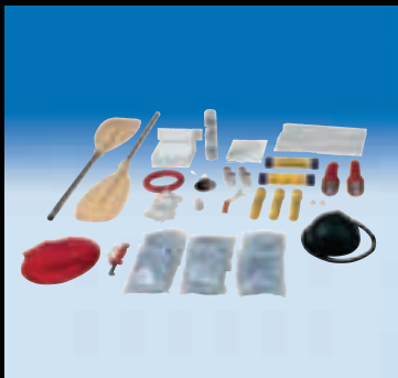
Over 24 hours Emergency Pack, contained in optional grab bag